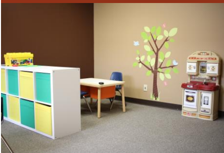
Our clinic, Roots on Craig, provides designated spaces for various age ranges and activities.

1810 Craig Road, Suite 109 Maryland Heights, MO 63146